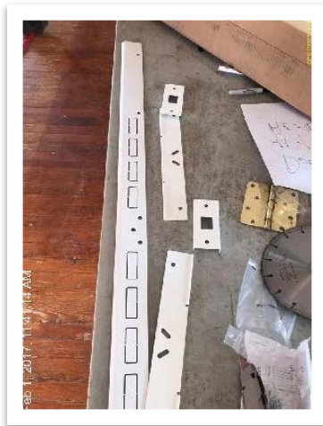
Photo showing door jamb and hinge protection product materials ready for installation.