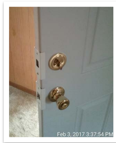
Photo shows door jamb protection product installed.