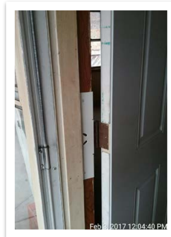
Photo showing door hinge protection product installed.