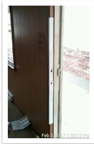
Photo shows door jamb protection product being installed.