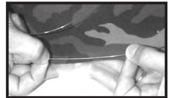
Apply Reinforcement Filament