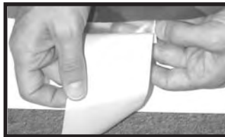
Apply Leaving 1 inch Tab Beyond Edge