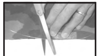
Cut Filament to Width of Patch