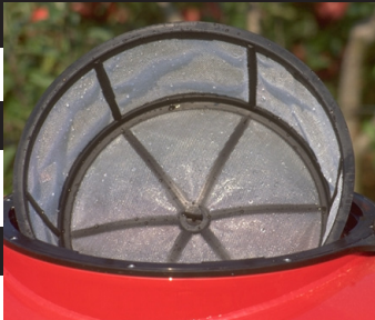
Plastic Basket-Type Strainer