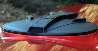
Easy-opening 1/8 Turn, Hinged Tank Lid