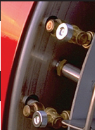
Double Rollover Nozzles