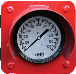
0-1000 PSI Pressure Gauge