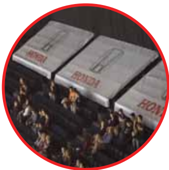
Area seat Control