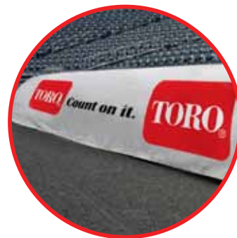
Tarp Roller Advertising