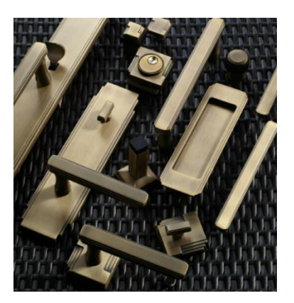
The new Art Deco Series from INOX offers a complete collection of products to transform utilitarian door locks, card readers and other hardware into custom-created, Jazz Age-style designs with a contemporary sensibility.