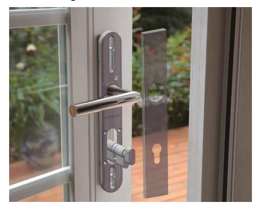
The INOX Universal Multipoint Series contains an innovative framework hidden beneath its trim, with an adjustable thru-bolt distance. Shown in MU105 with a transparent escutcheon plate.