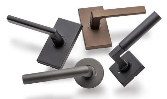
CeraMax lasts 85 times longer than stainless steel, and can face extreme exposure to high humidity and ultraviolet light for up to 5750 hours with no yellowing or loss of luster.