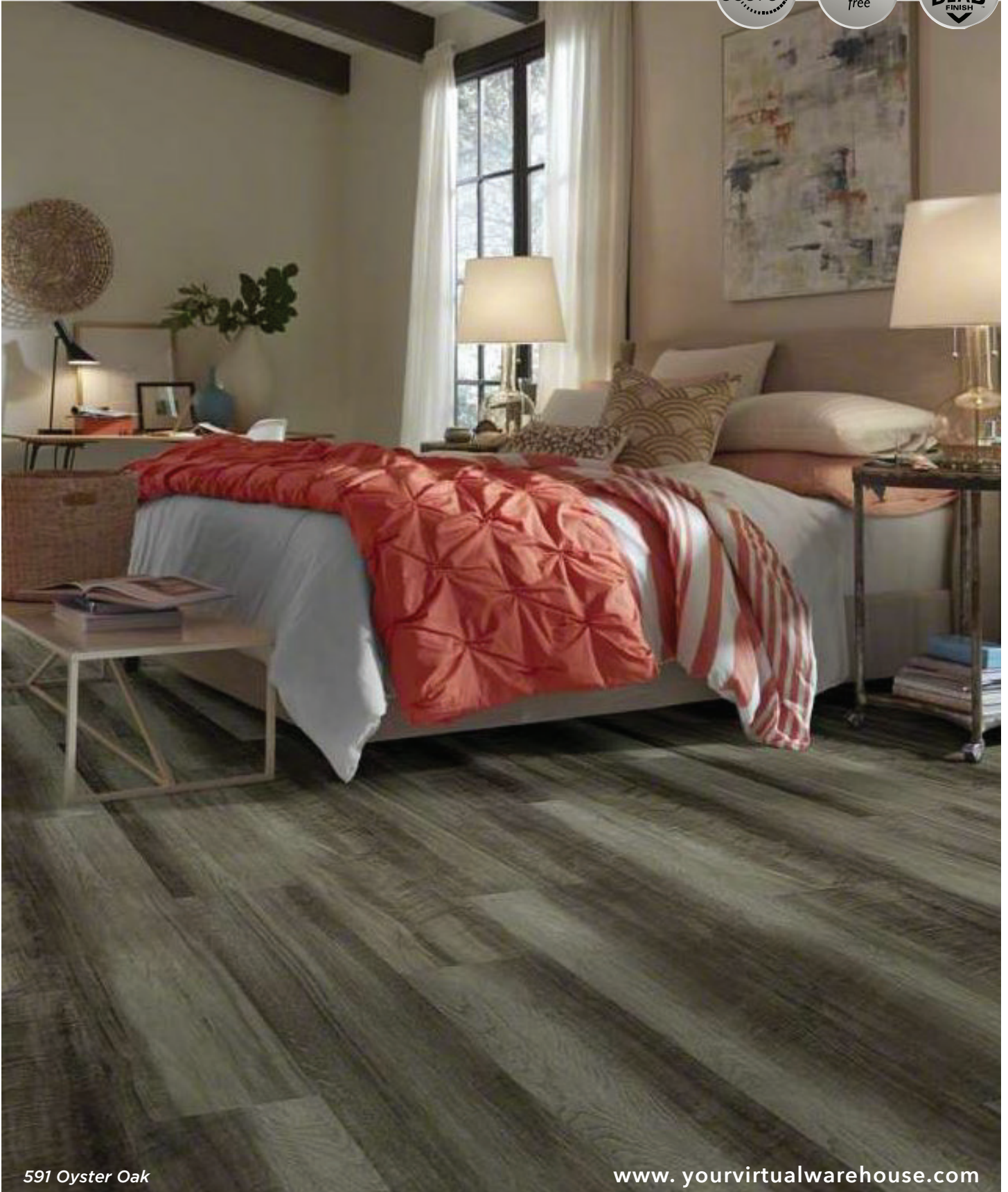
591 Oyster Oak