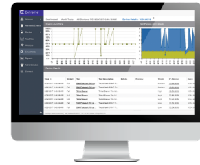
Information Governance Engine